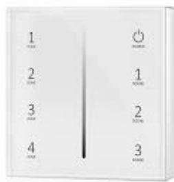
Mechanical Structures and Installations