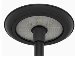
Centrally mounted luminaire with 360° light distribution