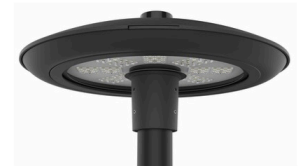
Suitable for Ø76mm column entry