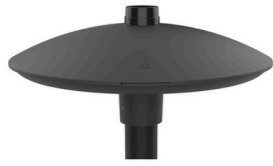
Standard 3/7 pin NEMA available or Zhaga sockets on request