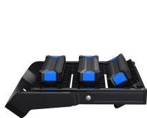
LED Flood Sports Light DIMENSIONS