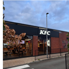
LED Eco Street Lantern Light DIMENSIONS